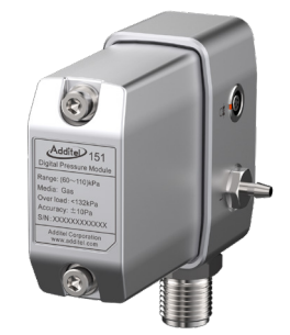
BP Pressure Module with Calibration Fixture